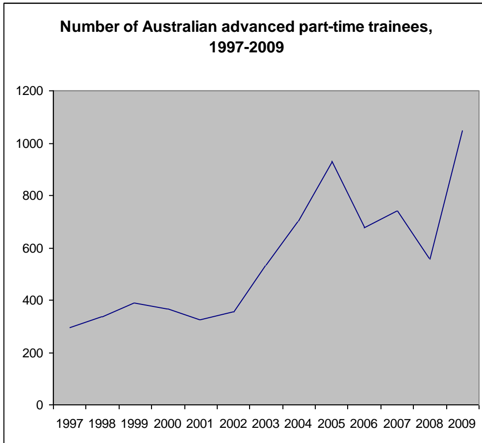
Figure 1 - Number of part-time advanced trainees, 1997–2009 39